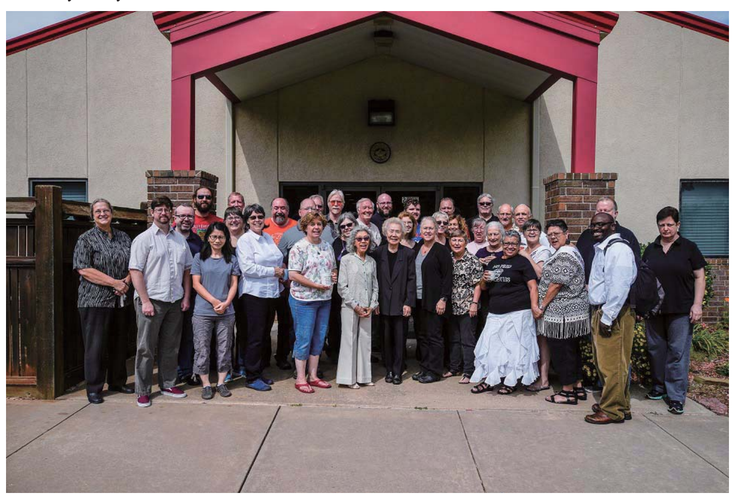
Members of the Oklahoma and San Antonio Dharma centers after a joint weekend training held at the Dharma Center of Oklahoma in 2016.