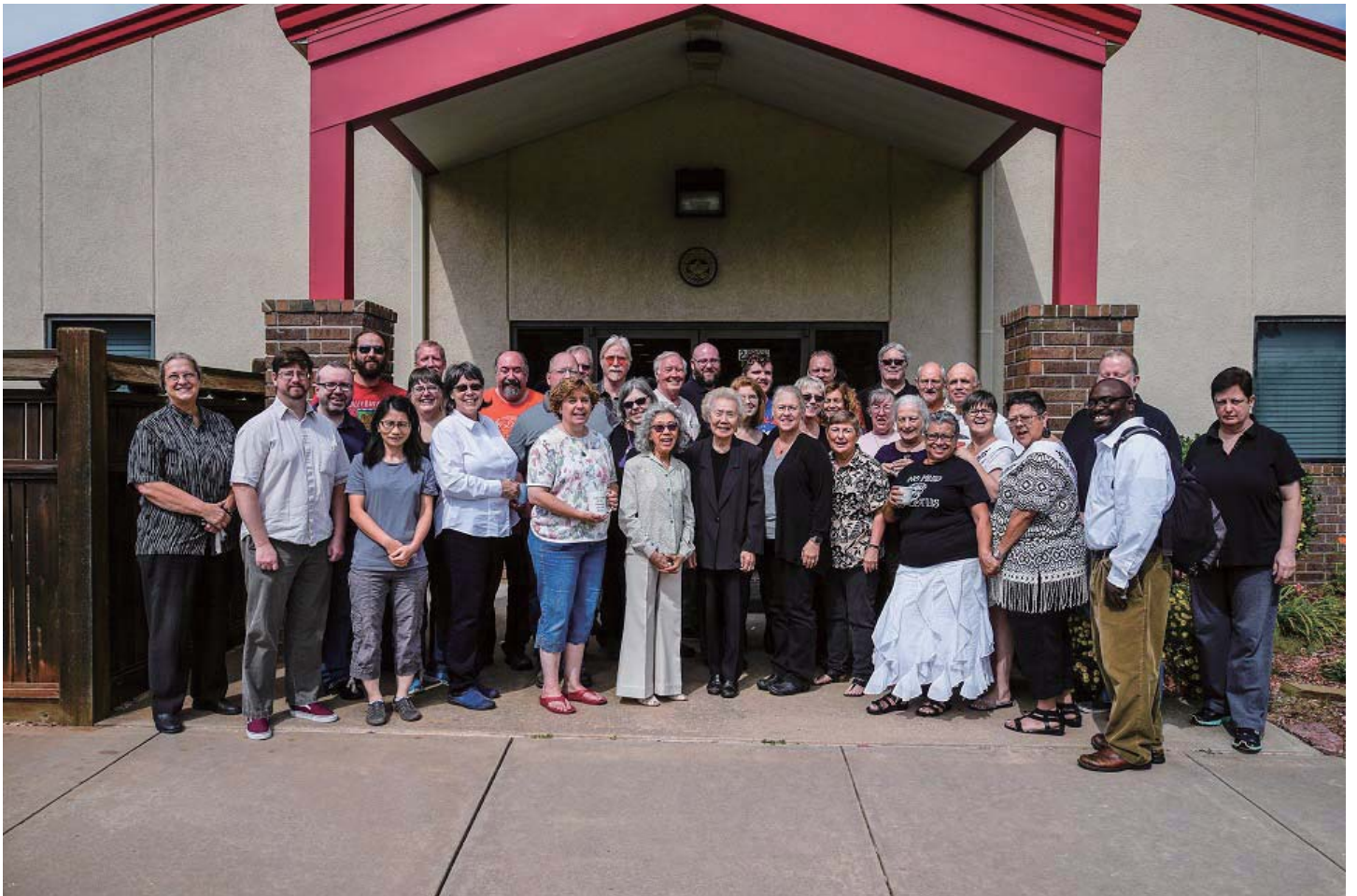
Members of the Oklahoma and San Antonio Dharma centers after a joint weekend training held at the Dharma Center of Oklahoma in 2016.